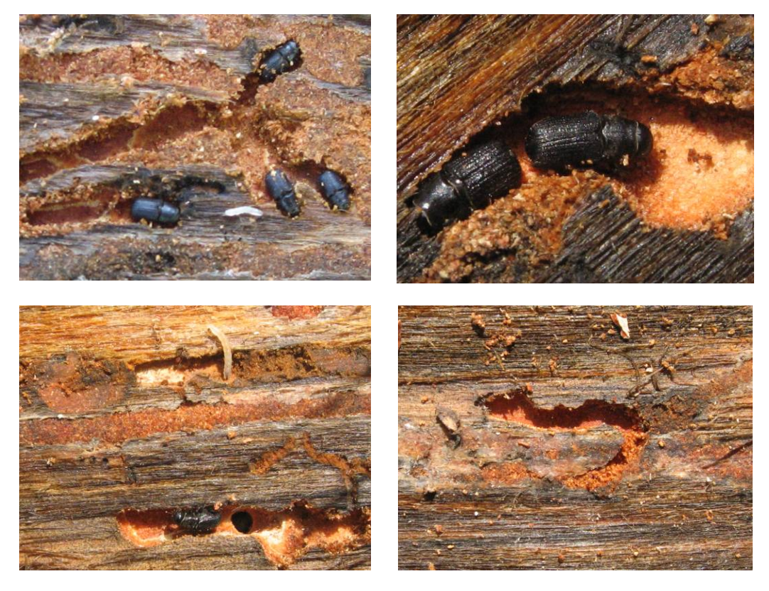
Figure 15. Dendroctonus ponderosae damage in lodge pole pine at Merritt, British Columbia. Picture shows adults and galleries packed with frass.