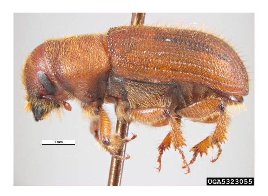
Figure 1. Dendroctonus valens (Source: <u>http://www.bugwood.org</u>).

Dendroctonus valens males and females are similar in appearance. Adults are 5.4 mm to 9 mm long, stoutly built and reddish brown in colour (Figure 1). The head is visible from above (Figures 1 and 12d), antennae are geniculate, with a 5 segmented funicle and 3 segmented, expanded club (Figure 12b). The pronotum is rounded, with punctation and without asperites (Figure 12d). Elytra (Figure 12c) have distinct raised striae, and are punctuate-granulate. Pubescence on the head and body is yellowish brown, long, soft and semi-erect. Larvae are C-shaped, legless and mainly white, with a distinct, dark head capsule, small dark patch at the tip of the abdomen and, in older larvae, a line of small darker tubercles laterally on the body.