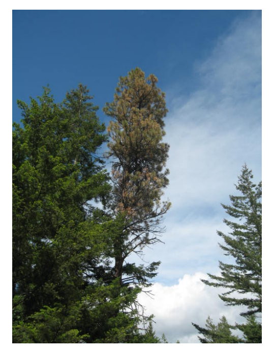
Figure 4 . Dying lodgepole pine tree ( Pinus contorta ) with brown crown caused by Dendroctonus ponderosae (Photograph J. King, Merritt, British Columbia).

Figure 3 . Lodgepole pine ( Pinus contorta ) forest with D. ponderosae damage. Area was salvage logged, young trees dying (Photograph J. King, Merritt, British Columbia).