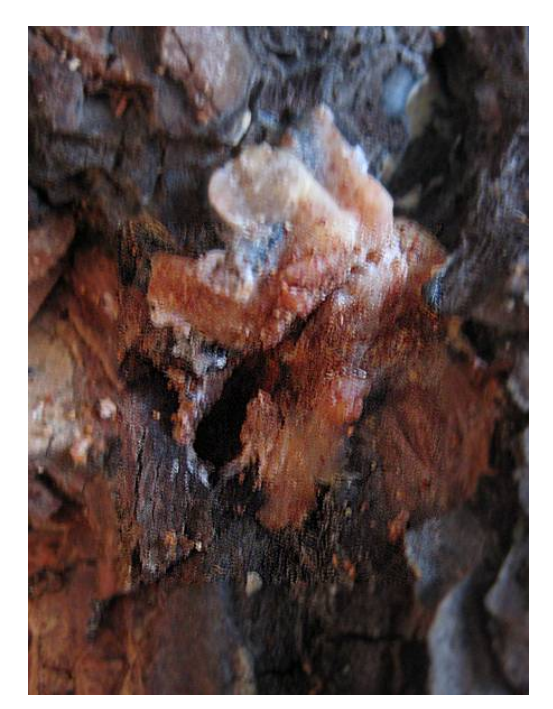
Figure 6 . Dendroctonus valens entrance hole on bark and developing pitch tube (Photograph J. King, Queensland Primary Industries and Fisheries, Department of Employment, Economic Development and Innovation, QPIF DEEDI).