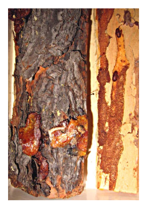
Figure 9 . Old pitch tubes on bark (left) and formation of galleries, frass and adults (right).

Adults emerge from pupa as pale tenerals. After about a week they are mature, with a redbrown integument, and they will then over-winter in the galleries for several months, or, in warm temperatures, emerge from the host after several days and disperse.