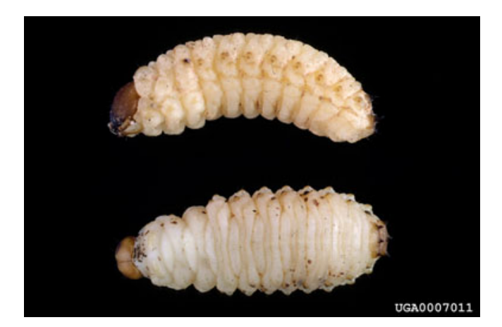
Figure 8 . Dendroctonus terebrans larvae. Almost identical to D. valens larvae, note lateral tubercles.

Larvae<sup>1</sup> are legless, white and C-shaped with a brown, sclerotised head capsule and a small dark area at the hind end (Figure 8). Later instars develop a row of small dark tubercles laterally on the body. Unlike many other Scolytinae larvae, some Dendroctonus larvae