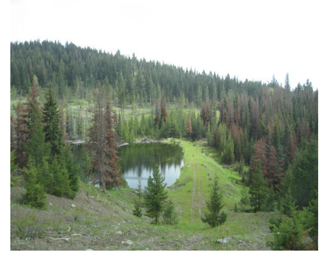
Figure 3 . Lodgepole pine ( Pinus contorta ) forest with D. ponderosae damage. Area was salvage logged, young trees dying (Photograph J. King, Merritt, British Columbia).

which result in tree death (Owen et. al. 2005; Wood 1963). Dendroctonus ponderosae (mountain pine beetle) are characterised by the development of solitary larvae that feed extensively in the phloem, leading to eventual death of the tree. In comparison, D. valens larvae feed gregariously in the phloem of the base of living trees or in the roots. Symptoms and sampling methodology of D. ponderosae is similar to D. valens (Figure 3 and 4).