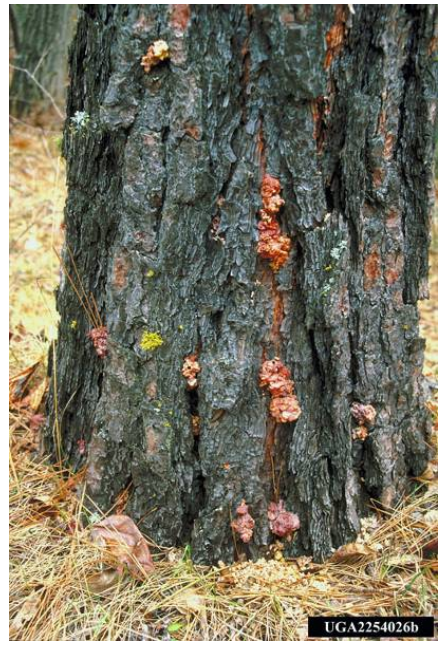
Figure 5 . Pitch tubes evident on a tree infested with Dendroctonus valens.

Eggs are laid in groups along the sides of the galleries, with the areas marked off by 'partitions' of frass and pitch borings (Figure 7). Eggs are ovoid, white and about 1mm long. There can be a few to more than one hundred in the egg mass, which extends up the gallery as a single long patch, or in several groups. Eggs hatch in 1-3 weeks.