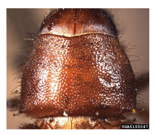
e) Pronotum with evenly sized punctures

d) Elytral declivity with surface shining, interstriae slightly and evenly elevated, with setiferous punctures granulate