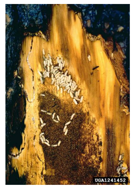
Figure 10 . D. valens larvae feeding (Photograph Ladd Livingston, Idaho Department of Lands, <u>http://www.bugwood.org</u>