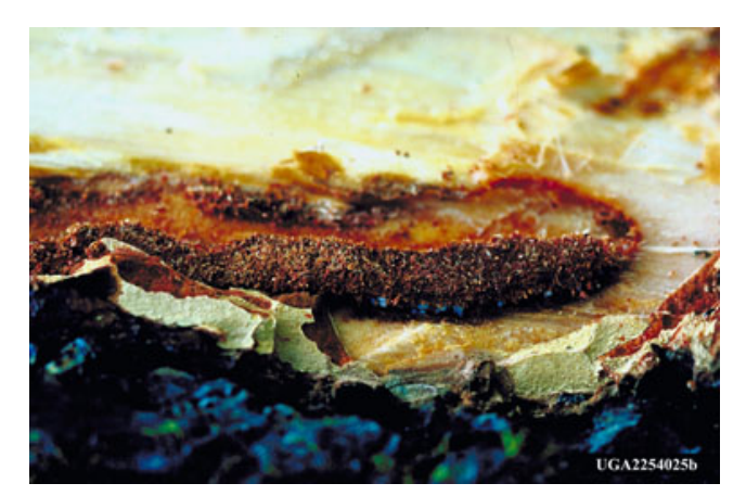
Figure 7 . Dendroctonus valens egg mass in gallery.