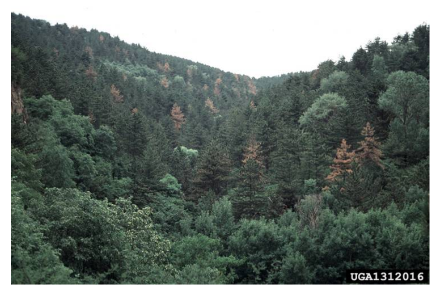
Figure 2. Dendroctonus valens damage to Pinus tabuliformis, China.

Dendroctonus valens, unlike most Dendroctonus species, has a wide host range. Kelly and Farrell (1998) list more than 30 recorded hosts or potential hosts in the genus Pinus , including Pinus radiata and P. taeda , both grown in Australia. Randall (2006) reports at least 40 hosts in America, in both native and exotic conifers, with P. ponderosae, P. contorta, P. radiata and P. coulteri the primary hosts in North America. RTB has also been recorded occasionally infesting Larix, Abies, Picea and Pseudotsuga species (Pajares and Lanier 1990).