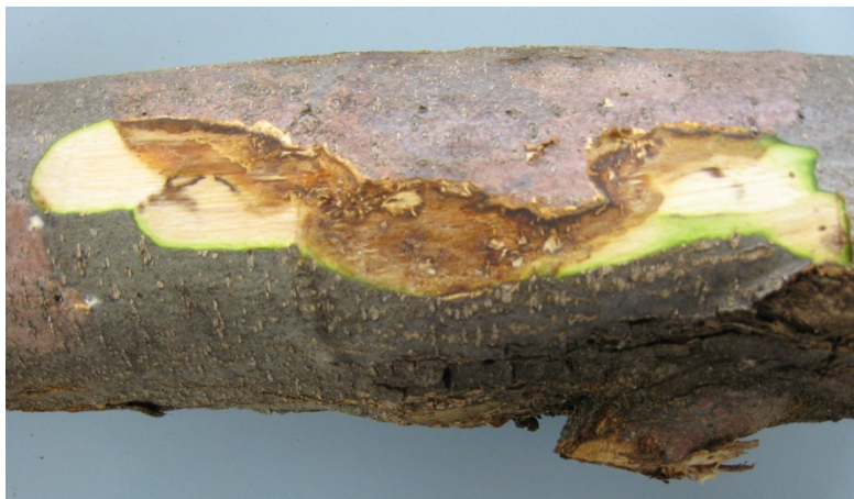
Figure 3. Isolation from a typical chestnut blight canker (photo courtesy Ramez Aldaoud, DPI Victoria).