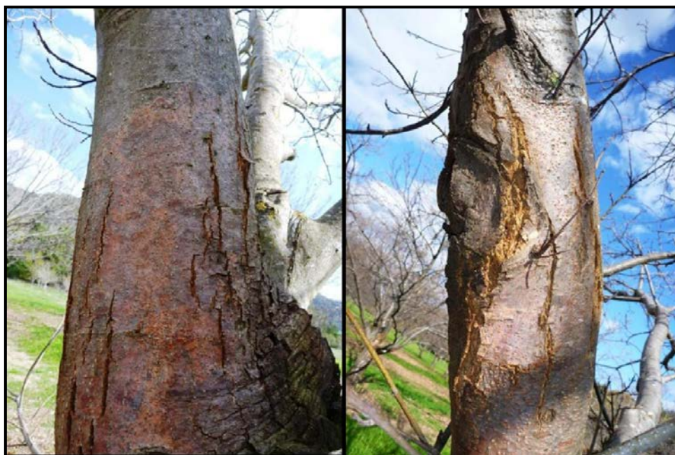
Figure 1. Cankers caused by Cryphonectria parasitica on Castanea sativa in Victoria, showing the splitting bark and swollen appearance of the stem.

The characteristic orange stromatic tissue on the bark of the host is visible macroscopically, however a hand lens will facilitate visualization of fruiting structures within this. Several related species and genera produce similar orange stromata, but it is not possible to adequately differentiate these without a detailed laboratory examination.