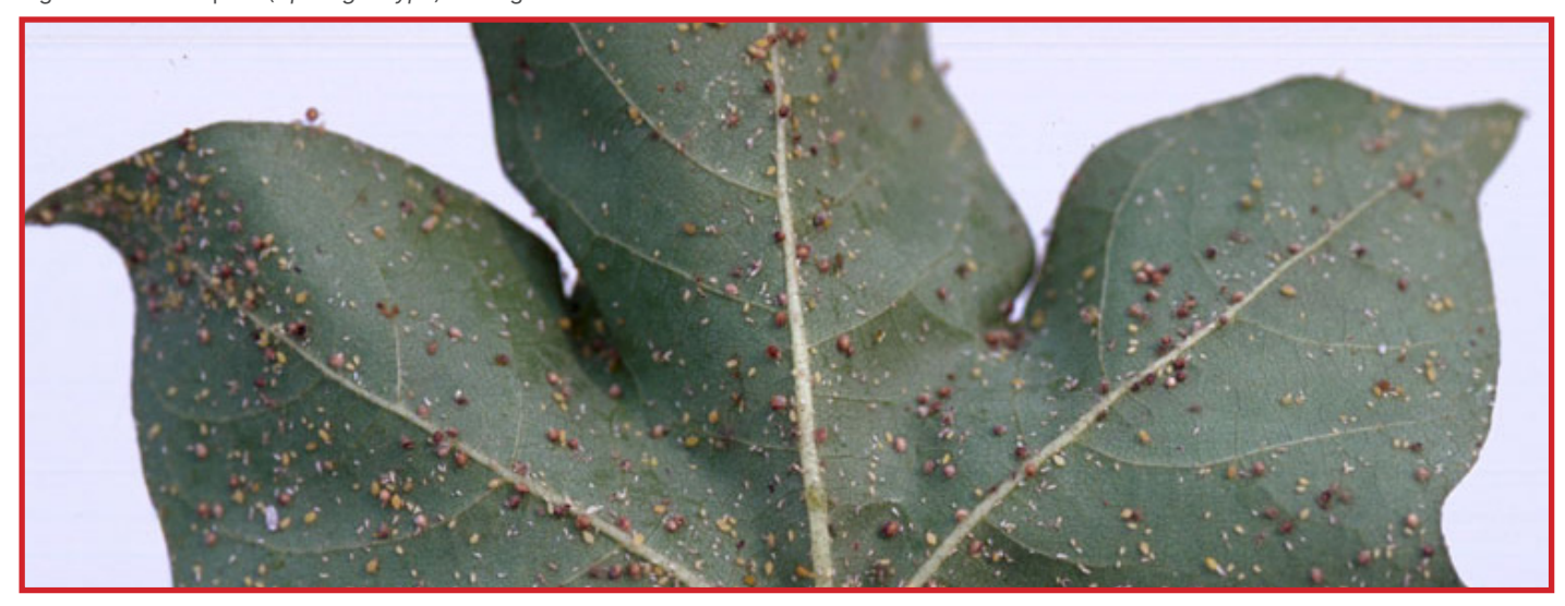
Figure 1. Cotton aphid (Aphis gossypii) damage

Exotic strains could be confused with locally occurring cotton aphid species. Insecticide resistance testing, molecular testing or pathogen testing would be needed to enable confirmation of an exotic strain. Exotic variants are found in the United States, South America, Southeast Asia, and Africa. Cotton aphid may be confused in the field with other aphid species, including green peach aphid and cowpea aphid.