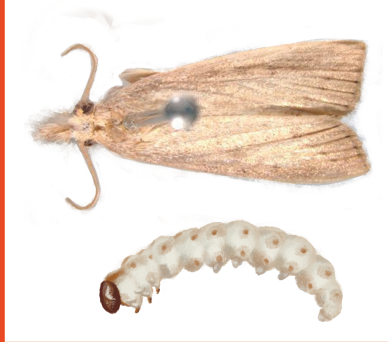
Figure 1. Sugarcane stem borer (Chilo terrenellus) adult and larvae

This guide covers the Sugarcane stem borer ( Chilo terrenellus ). Check the additional exotic guides for specific information for the other two possible exotic sugar cane borers.