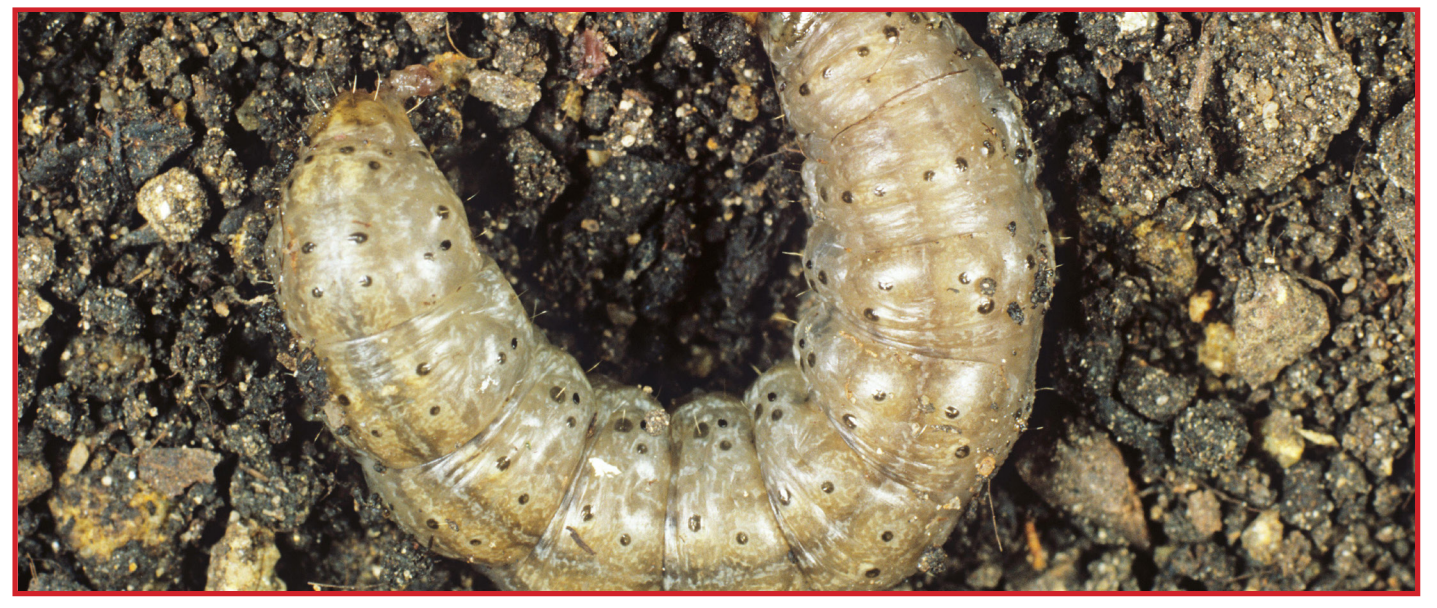
Figure 1. Turnip moth larvae (Agrotis segetum)

Agrotis species are commonly distributed throughout Australia. Since there is some host range overlap between endemic Agrotis species and Turnip moth, as well as similarities in feeding damage (e.g. cut stems), differentiation of these species may be difficult. Turnip moth adults and larvae are difficult to correctly identify in the field and would require assessment by a trained entomologist as dissection may be necessary.